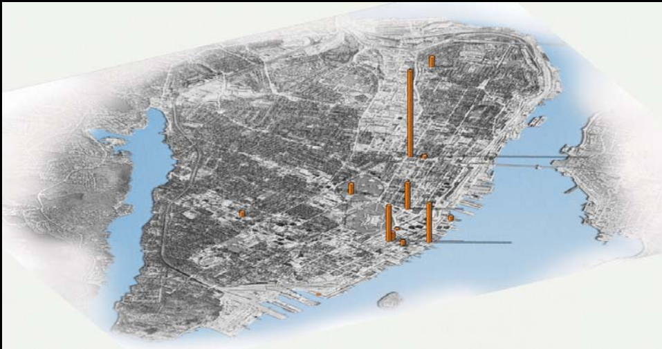
Illustration: Jeff Haggett

Challenges: Few flexible part-time jobs; high cost to tour from Halifax